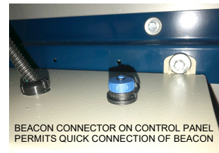
BEACON CONNECTOR ON CONTROL PANEL PERMITS QUICK CONNECTION OF BEACON

Fast Flash rate is selectable at 80/min. or 240/min.