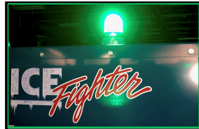
Displays Flashing Green on Call for Heat and Burner Operation Displays Solid Green when Burner is Firing