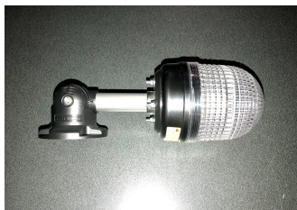
Optional 5" Extension Tower Kit Available Improves Line of Sight & Includes Fold Down Feature