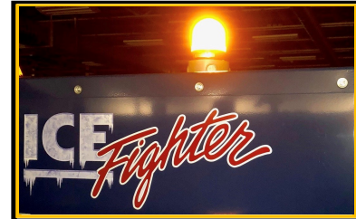
Displays Solid Amber when Power is Supplied & Switched On Displays 1 Second Amber Flash Rate During Cool-Down Cycle Displays 2 second Amber Flash Rate in Ventilation Mode