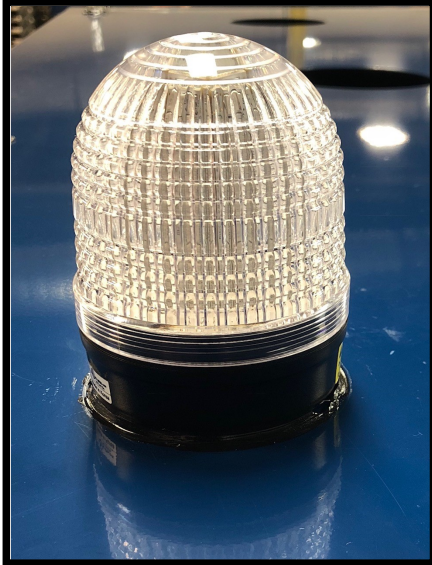
UL (US/Can) Approved IP65 Weatherproof - RoHS Compliant

LONG LIFE HIGH INTENSITY 3 COLOR LED ARRAY PROVIDES HIGH VISIBILITY EVEN IN FULL DAYLIGHT