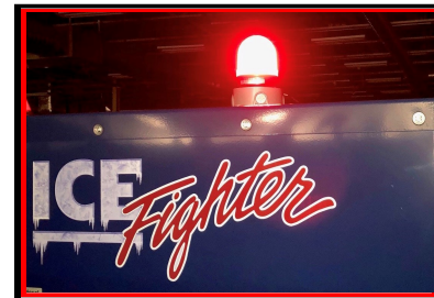
Displays Flashing Red on Alarm Conditions